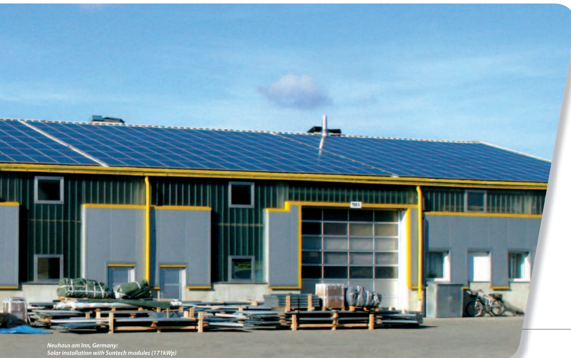
Neuhaus am Inn, Germany: Solar installation with Suntech modules (171kWp)

More and more solar installations are being installed on the roofs of industrial and office buildings, sports clubs and supermarkets. With good reason: These roofs offer large surface areas with minimal shade, thus enabling maximum performance and yield – and attractive profits.