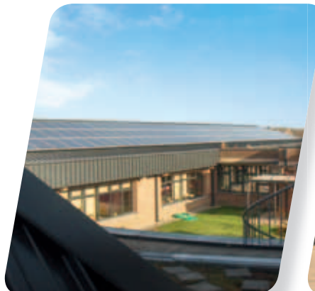
Steenokkerzeel, Belgium: Kindergarten with Suntech modules

After everything has been sorted out, you can simply sit back and relax. Your professional installer will deliver and install your solar installation on time.