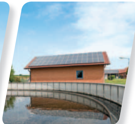
Friele, Germany: Waste water treatment plant with Suntech modules