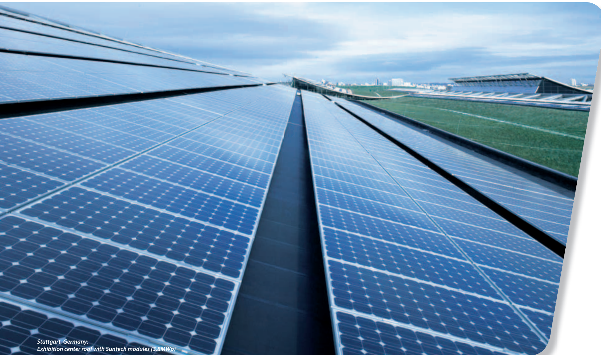
Stuttgart, Germany: Exhibition center roof with Suntech modules (3.8MWp)