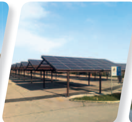
Rome, Italy: Car park roofing with Suntech modules